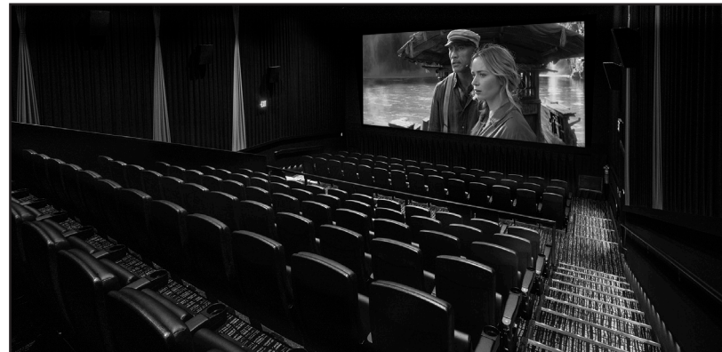
Interior of theater at the Broad Theater.