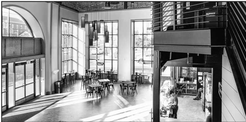
Lobby view of the Broad Theater.

For more information about the Broad Theater, please visit www.broadtheater.com or call (215) 721-3530 for showtimes or private theater rentals for birthdays and corporate events.