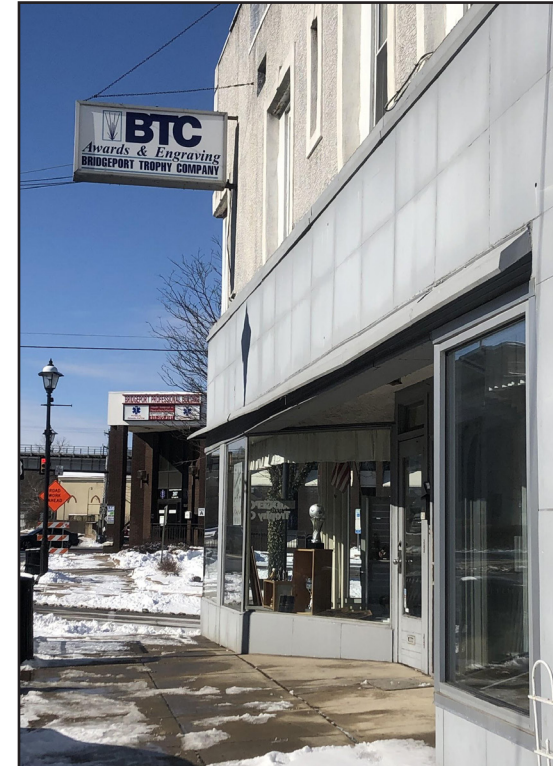
Bridgeport Trophy Company storefront.

Find BTC at their website btcawards.com or phone number 610-275-7677.