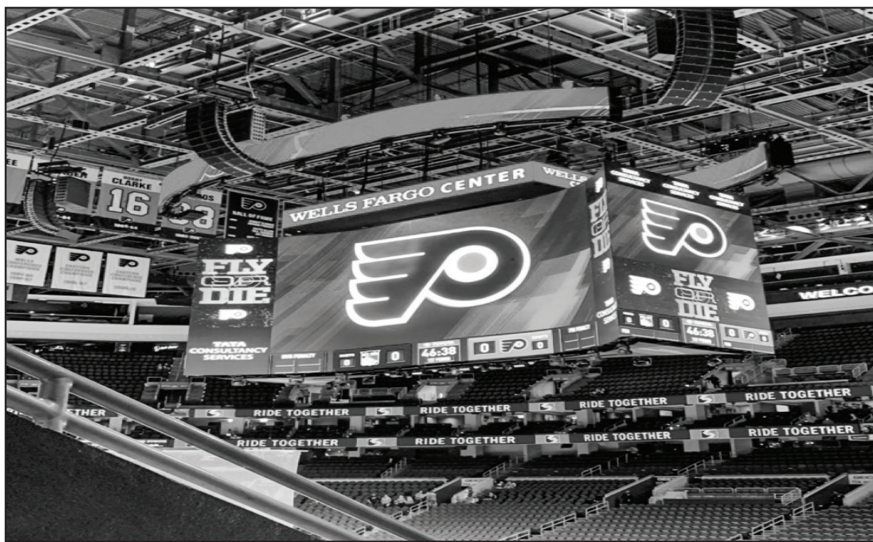
Wells Fargo Center jumbotron.