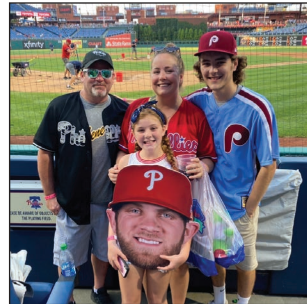
Family at Citizens Bank Park, August 2021

being arguably worse than the original talent, at least in the pitching rotation.