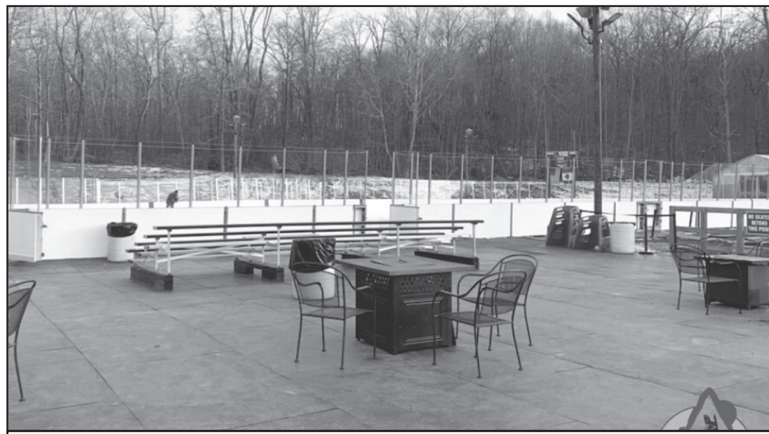
Spring Mountain ice rink.

The family is hoping the addition of Spring Mountain Ice will become another reason to continue visiting the destination that provides family fun for all ages each winter. Ready to lace up and experience skating under the stars? Visit their website, springmountainadventures.com , for dates, times, special events, or even a peek at the rink via their webcam.