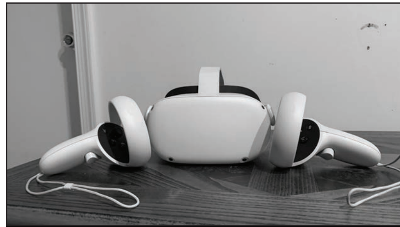
The Oculus Quest 2.

Overall, if you are in the market for a VR headset, the Oculus Quest 2 won't disappoint.